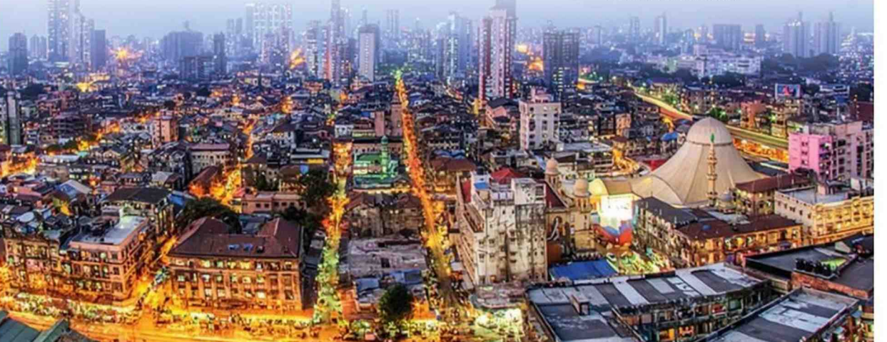
View of Bhendi Bazaar

The project in Bhendi Bazaar stands as more than a local endeavour; it emerges as a national exemplar for rejuvenating inner-city areas, says the trust. “By injecting resources and innovative planning into older areas, we have the opportunity to breathe new life into these historic quarters, not only upgrading physical structures but also fostering a sense of community and sustainable urban living. Such initiatives, mirroring the success of Bhendi Bazaar, can serve as a catalyst for nationwide urban renewal, reshaping the urban landscape and setting benchmarks for thoughtful development. The success of Bhendi Bazaar could well be the inspiration needed to turn other dilapidated clusters in different cities into vibrant, sustainable havens for their residents,” they add.